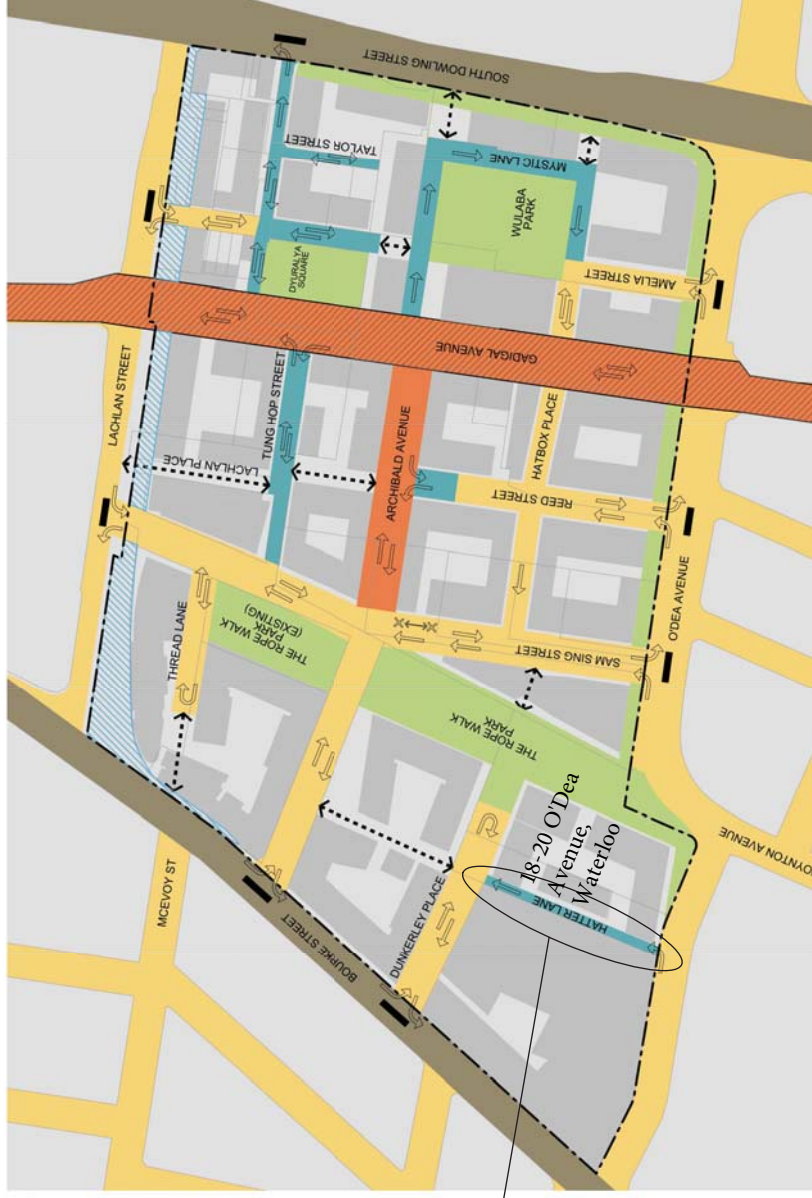
Lachlan Precinct - Public Domain Strategy